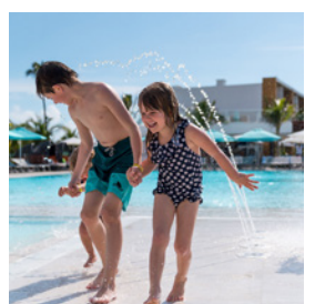
CHILDREN'S SWIMMING POOL WITH WATER GAMES

Outdoor Pool Depth (min/max): 1m / 1.7m This freshwater infinity pool is ideally located between the sea and the lagoon, in the centre of the Resort.