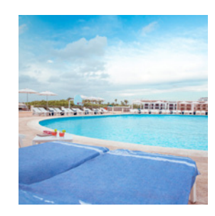
MAIN SWIMMING POOL

Outdoor Pool Depth (min/max): 0.3m / 1.3m A new swimming pool dedicated exclusively to parents and their children.